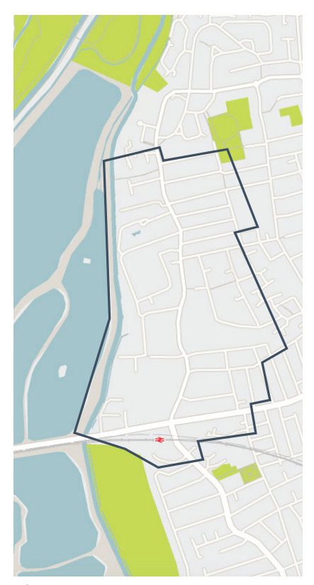
Figure 2: Research survey area