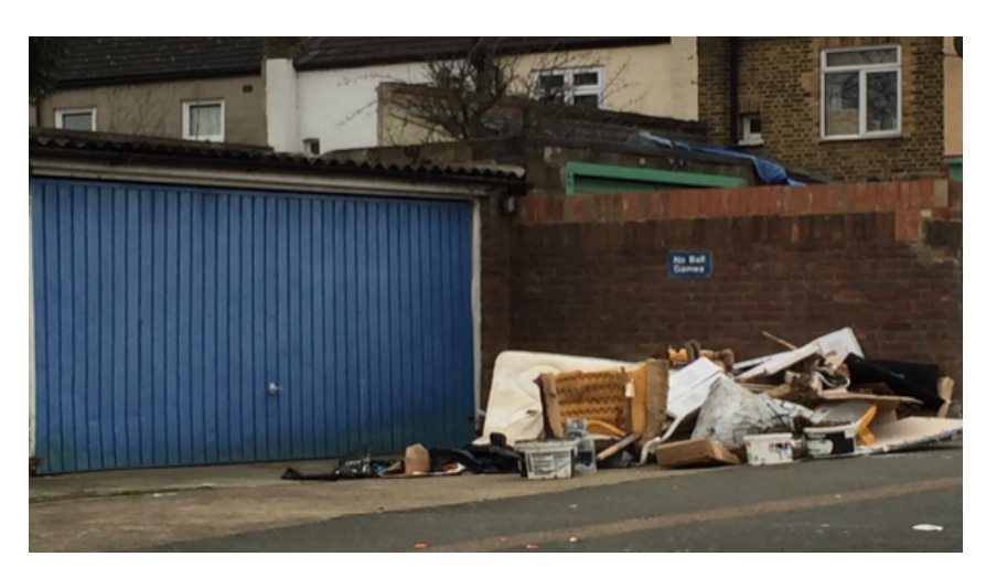
Figure 10: Flytipping. Image captured during walking interviews in the Blackhorse Lane area