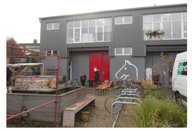
Figure 3: Development site in the Blackhorse Lane area (left). One of the construction sites in the Blackhorse Lane area Figure 4: Blackhorse Workshop (right). Makerspace in Blackhorse Lane supporting the creative industries