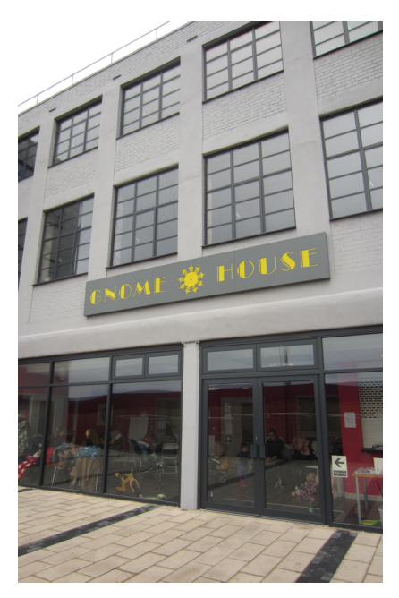
Figure 5: Gnome House community centre on Blackhorse Lane