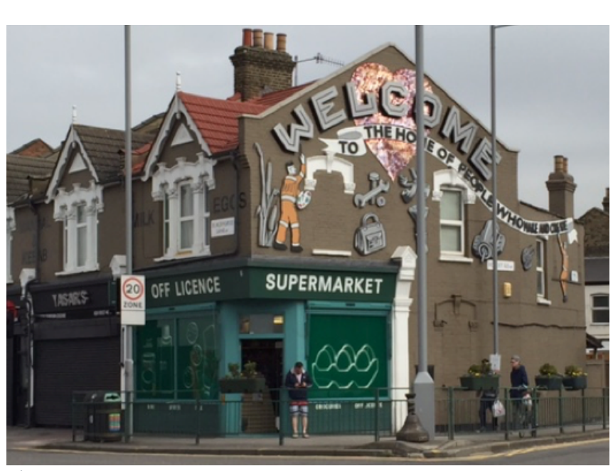
Figure 1: Blackhorse Lane mural. Located opposite Blackhorse Road station

For more information visit: http://wearekaizen.co.uk http://www.social-life.co/